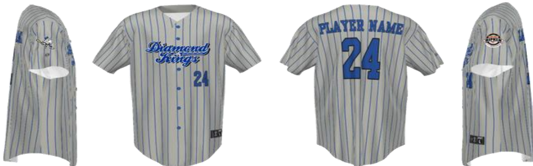
Grey/Royal Pinstripes (button up)