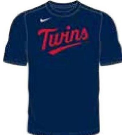
Minnesota Twins N 223-44B-TIS-J74 NY23- 44B-TIS-J74 N 199-44B-TIS-J81 NY28-44B-TIS-J81 Midnight Navy