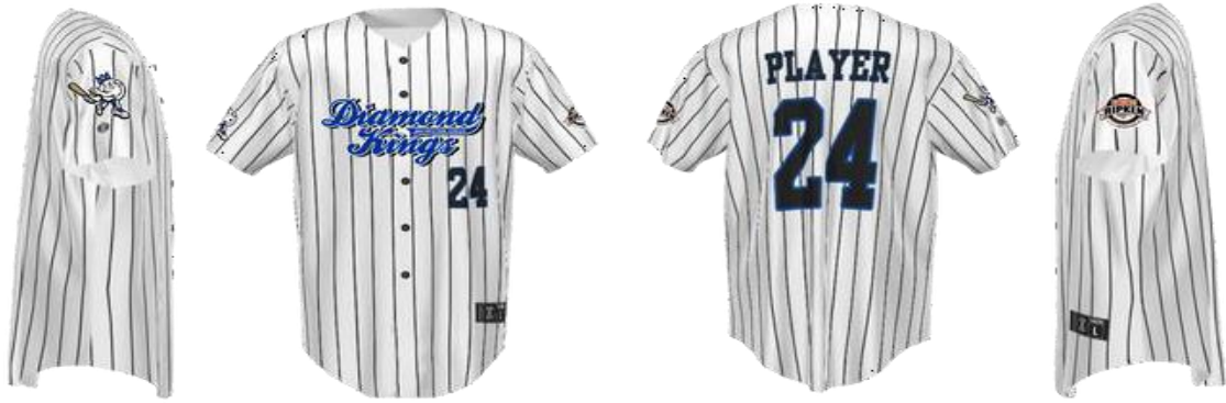
White/Black Pinstripes (button up)