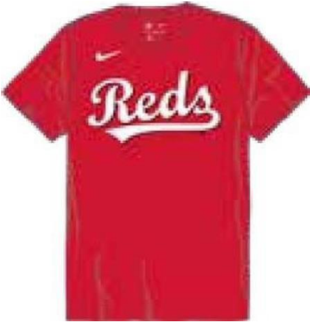
Cincinnati Reds N223-62O-RED-J74 NY23-62O-RED-J74 N 199-62O-RED-J81 NY28-62Q-RED-J81