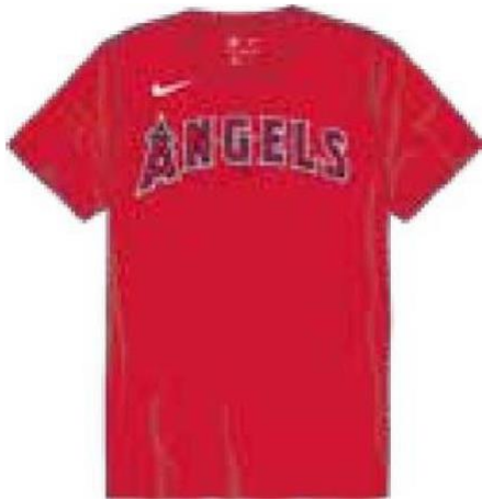
Los Angeles Angels N223-62O-ANG-J74 NY23-62O-ANG-J74 N199-62O-ANG-J81 NY28-62O-ANG-J81 Sport Red