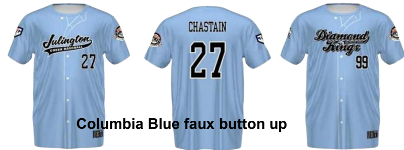
Columbia Blue faux button up