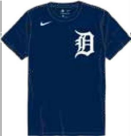
Detroit Tigers N223-44B-DG-J74 NY23-44B-DG-J74 N199-44B-DG-J81 NY28-44B-DG-J81