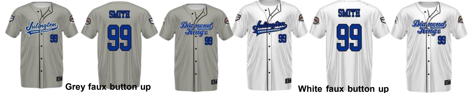
Grey faux button up