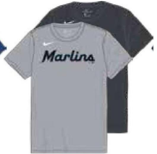
Miami Marlins N223- 01V-MOM-J74 NY23-01V- MOM-J74 N199-06F-MOM- J81 NY28-06F-MOM-J81 Wolf Grey, Anthracite