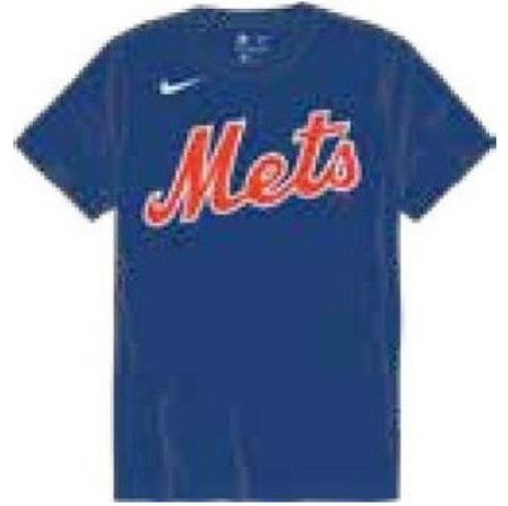
New York Mets N223- 4EW-NME-J74 NY23- 4EW-NME-J74 N199- 4EW-NME-J81 NY28- 4EW-NME-J81 Rush Blue