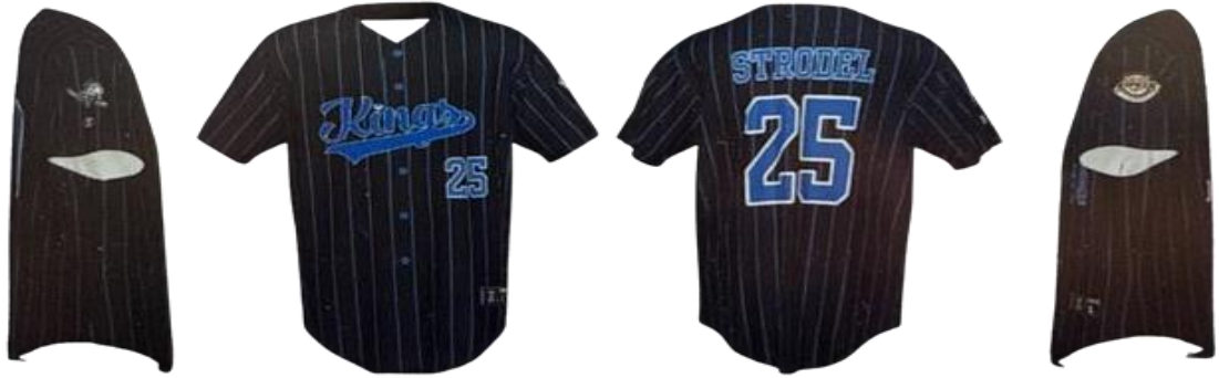
Black/Royal Pinstripes (button up)