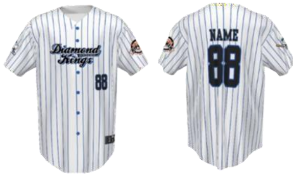
White/Royal Pinstripes (button up)