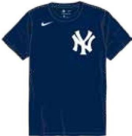
New York Yankees N223-44B-NK-J74 NY23-44B-NK-J74 N199-44B-NK-J81 NY28-44B-N K-J81 Midnight Navy