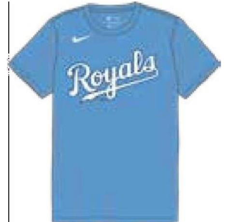
Kansas City Royals N223-4EY-ROY-J74 NY23-4EY-ROY-J74 N199-4EY-ROY-J81 NY28-4EY-ROY-J81