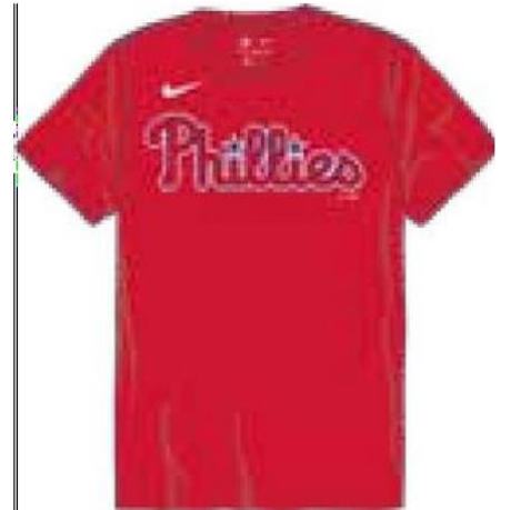
Philadelphia Phillies N223-620-PP-J74 NY23- 620-PP-J74 N199-620- PP-J81 NY28-620-PP- J81 Sport Red