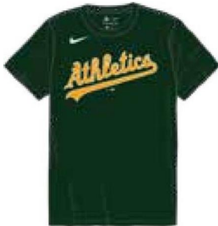
Oakland Athletics N223-3EY-FZ-J74 NY23-3EY-FZ-J74 N199-3EY-FZ-J81 NY28-3EY-FZ-J81 Pro Green