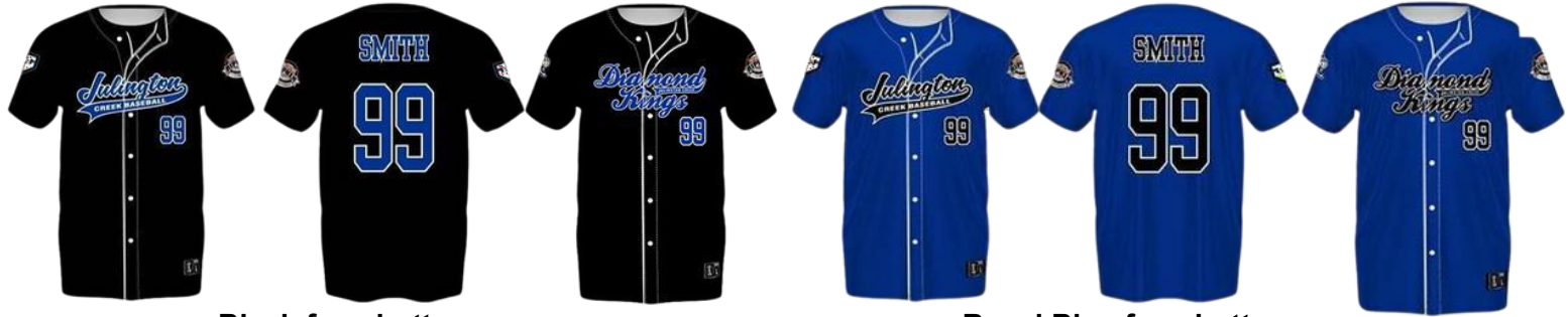
Black faux button up