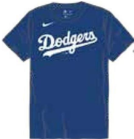
Los Angeles Dodgers N223- 4EW-LD-J74 NY23-4EW- LD-J74 N199-4EW-LD-J81 NY28-4EW-LD-J81 Rush Blue