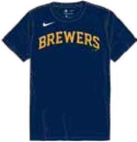
Milwaukee Brewers N223-44B-MZB-J74 NY23-44B-MZB-J74 N199-44B-MZB-JS1 NY28-44B-MZB-J81 Midnight Navy