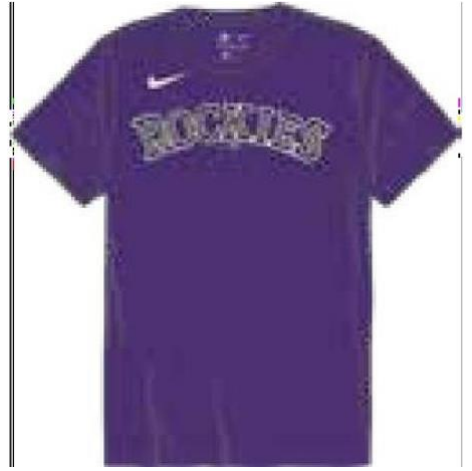
Colorado Rockies N223-51L-DNV-J74 NY23-51 L-DNV-J74 N199-51L-DNV-J81 NY28-51 L-DNV-J81