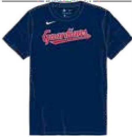
Cleveland Guardians N223-44B-IAN-J74 NY23-44B-IAN-J74 N199-44B-IAN-JB1 NY28-44B-IAN-J81